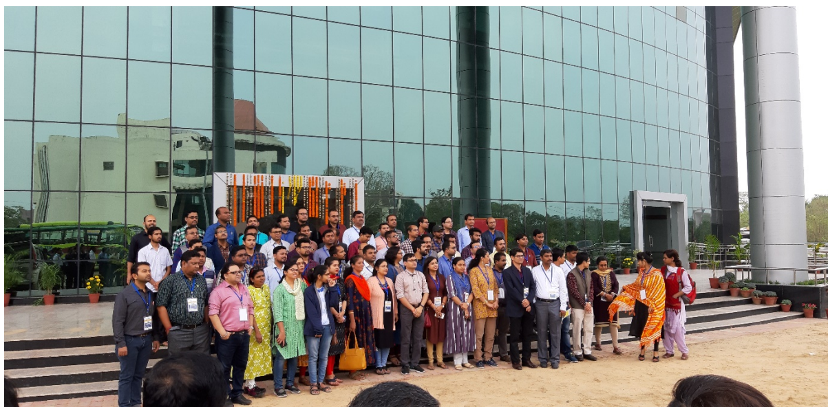
Photographs of participants

The detailed program schedule is given below: